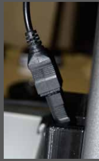
2.5 Connecting the Camera to an USB-port

Open the covering with the following or similar labelling "A/V Out USB HDMI" at the left side of the camera. Now plug the black USB cable you can find in the camera's packaging into the slot marked red on the picture below and into a vacant USB-port of your computer.